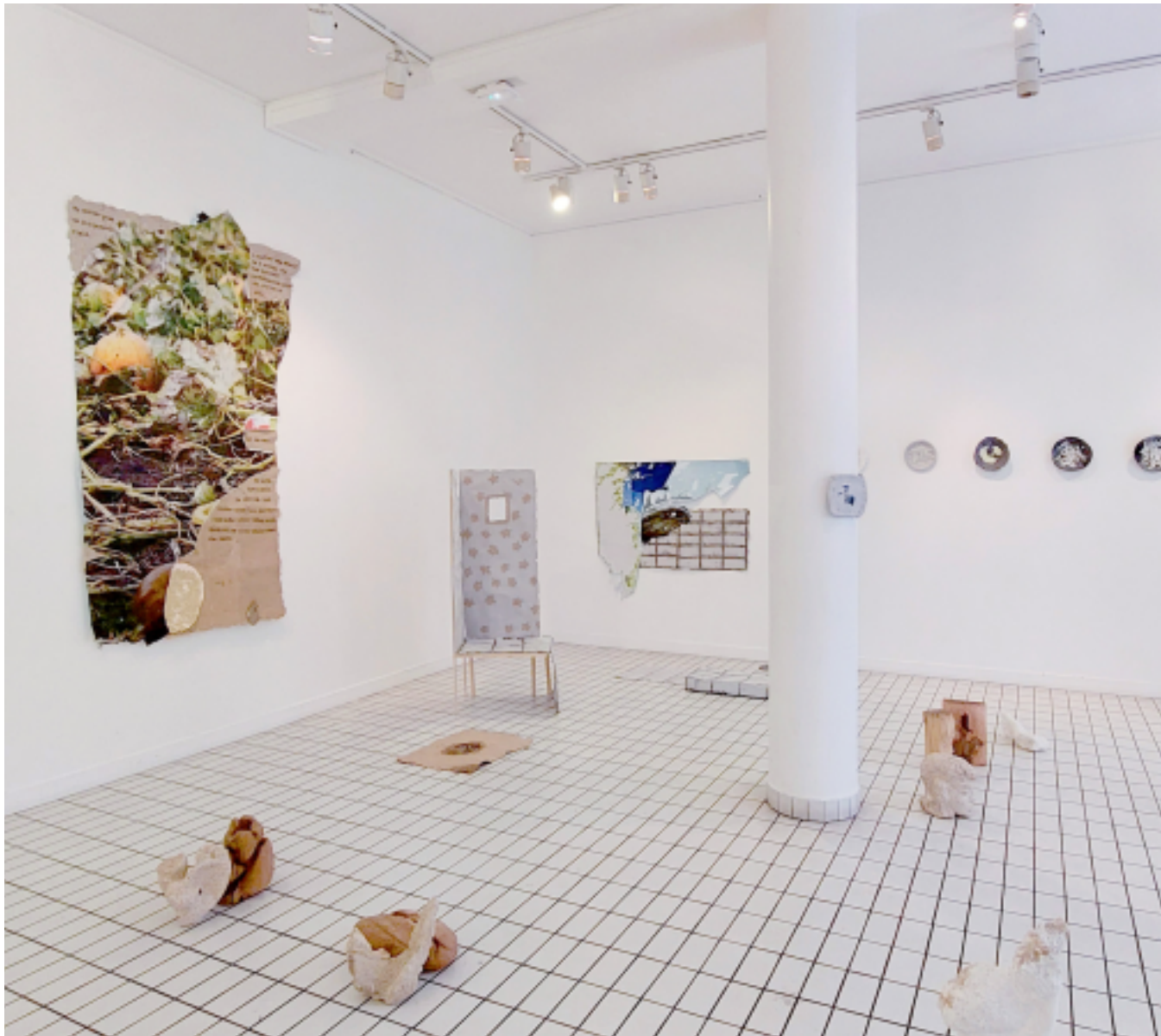
Old news new home 2022, Hylé, group show Galerie du Montparnasse, Paris