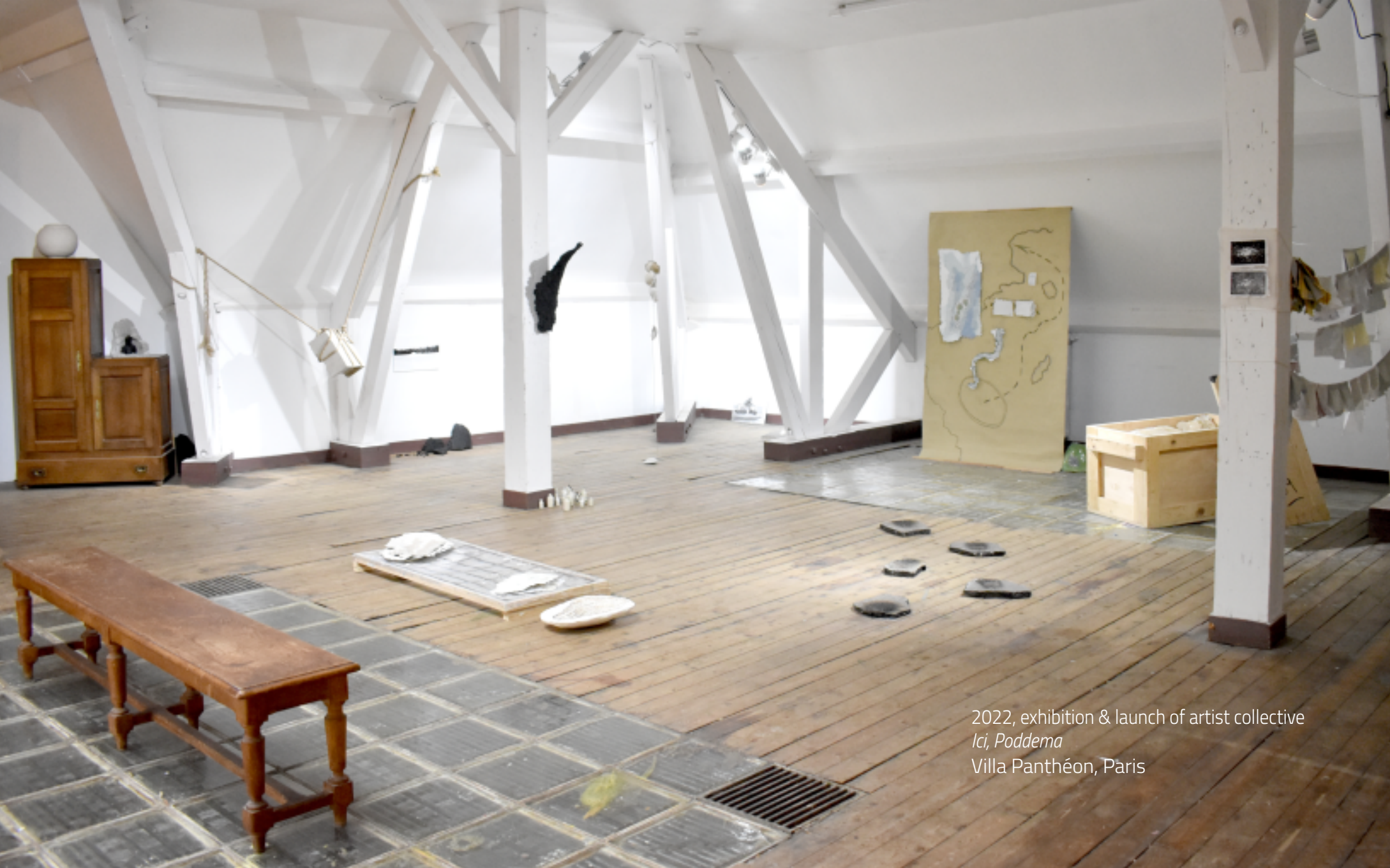
2022, exhibition & launch of artist collective lci, Poddema Villa Panthéon, Paris