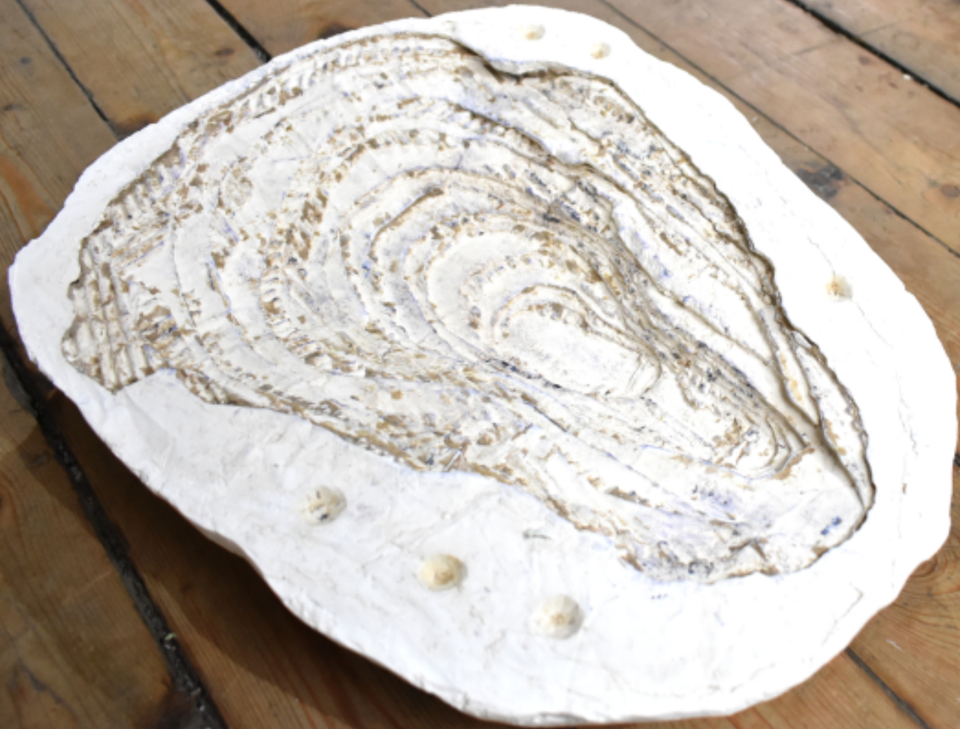
Les ouïes 2022, 45 x 35 x 26 cm installation, plaster Villa Panthéon, Paris