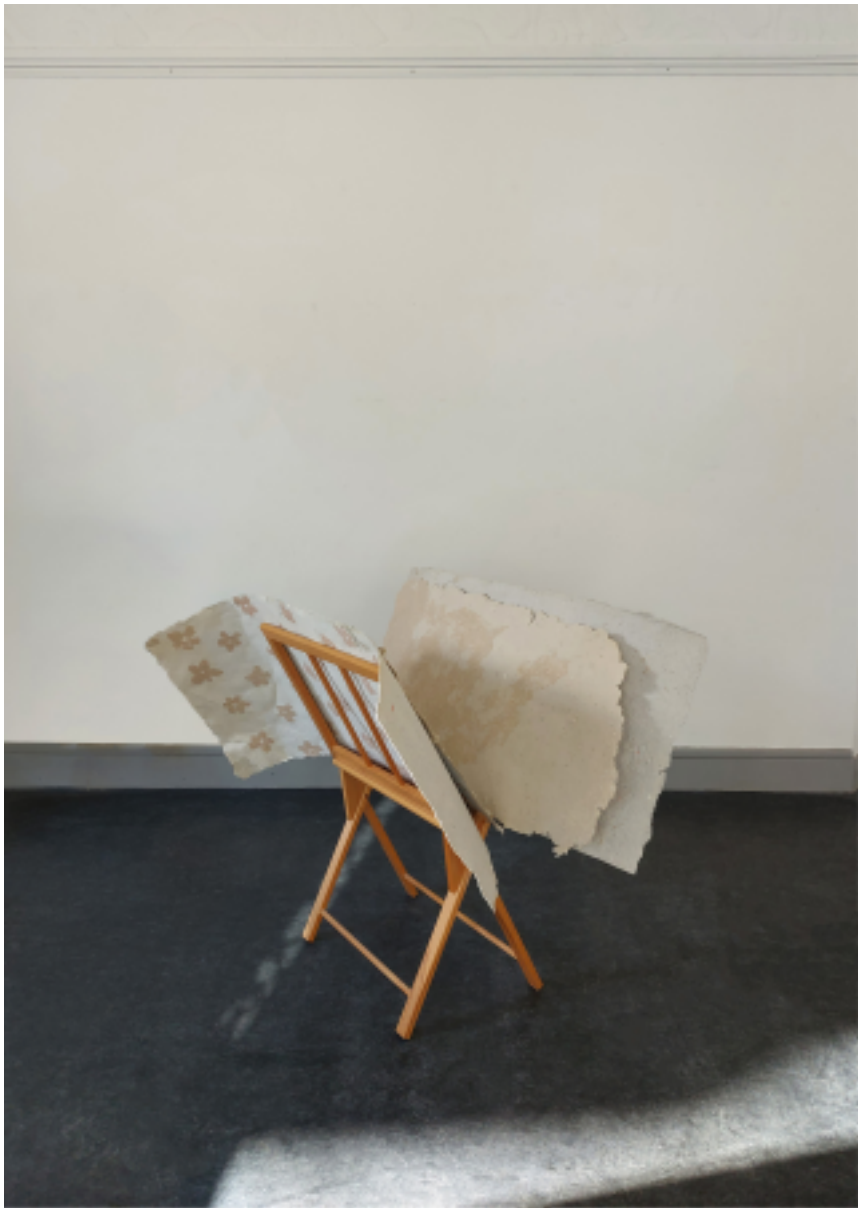
2022, 120 x 60 cm series of paper sheets made by the artist Espace Bouchor, Paris